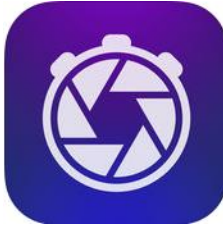
Photo Editing Apps